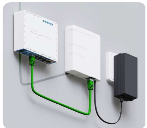
A basic setup inside customer premises to provide the Internet connection. Power adapter is not included in the package.