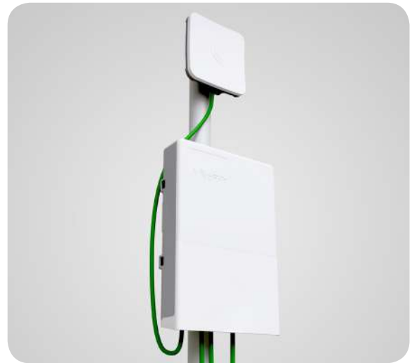
The GPEN family of products includes switches with outdoor enclosures, which support powering from PoE sources, such as the GPEN11 injector.

The GPEN unit can be securely attached to a wall, or communications cabinet. The ethernet cable can be routed either directly through it's bottom cable opening, or into the wall, as preferred.