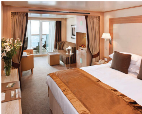
From top: Seabourn Quest docked in Olden, a town filled with cafes and boutiques, among other traveler attractions; featuring a full-length window and a sliding glass door to a private veranda, the Veranda Suites on the Seabourn fleet offer panoramic views. They also include a living area, a dining table for two, walk-in closets, a fully stocked bar and a marble bath with double vanities.

All of this came as a very pleasant surprise to me, as the one time I'd cruised before, I couldn't wait to get back on land. But on this trip, when we disembarked in Dover, I was shocked to find myself feeling a bit wistful, and more shocked when, weeks later, I was still talking about the journey and recommending it to friends. Similar 14-day excursions from $7,499 per person, seabourn.com ■