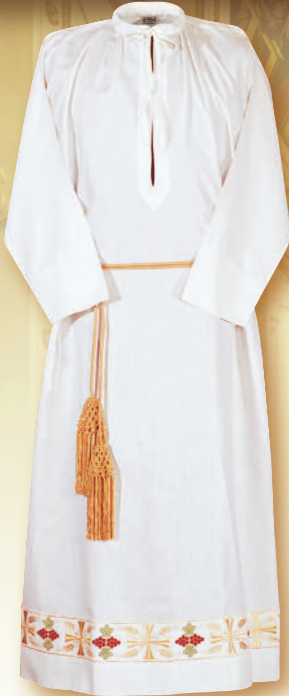
Garment style 55 with Banding style 1878 – No.55-1878