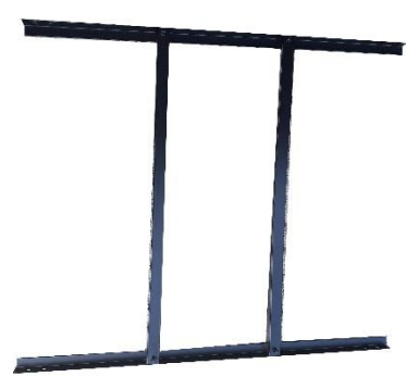
You should now have this

3. Select the 4 corner braces. Attach long angle cross braces to the inside of the corner braces using SHORT bolts. Make sure the longer side of the corner brace is pointing up (you are making this upside down for now) – Just finger tight for now.