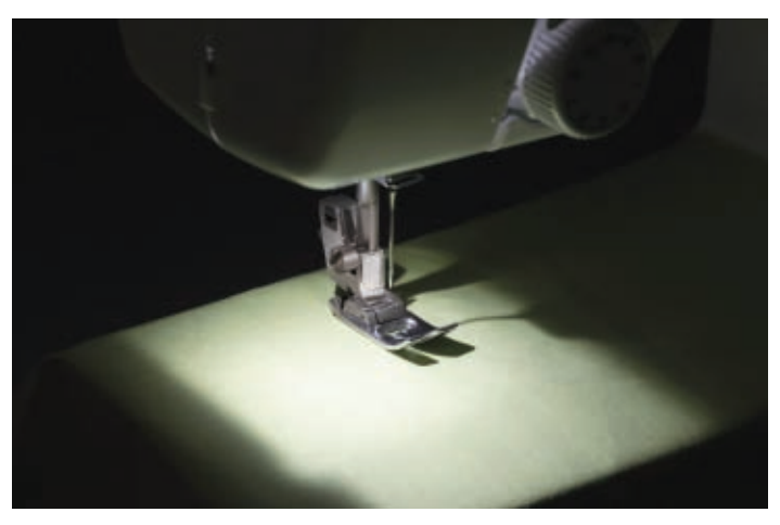
LED lighting for easy viewing