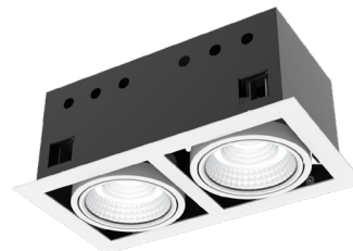
PR Tilt Grill Light - 2 x 30W - 4000K - 3YR