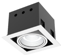
PR Tilt Grill Light - 1 x 30W - 4000K - 3YR