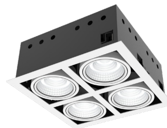
PR Tilt Grill Light - 4 x 30W - 4000K - 3YR