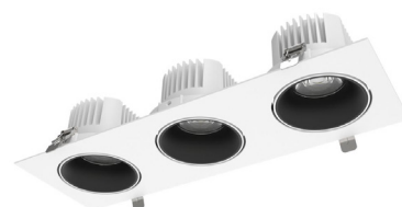
ST Tilt Grill Light - 3 x 30W - 4000K - 3YR