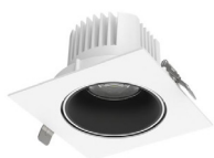
ST Tilt Grill Light - 1 x 30W - 4000K - 3YR