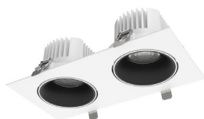
ST Tilt Grill Light - 2 x 30W - 4000K - 3YR