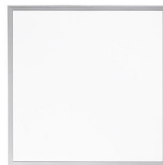
BL Panel Light 600 x 600 - 36W - 5000K - 3YR