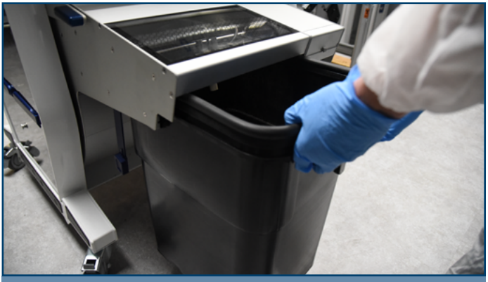
INTEGRATED SEPARATION SYSTEM

The Mobius Spring Jack Tool is the key to quickly achieving ideal and consistent tumbler tension. It's the only tool you'll need to disassemble the M108s for cleaning and comes standard with the machine. When affixed to the lid, the Spring Jack releases the tension holding the tumbler in place, allowing it to be effortlessly removed. When the tumbler is installed, the SpringPack lid holds it perfectly in place with even tension eliminating the potential for user error.