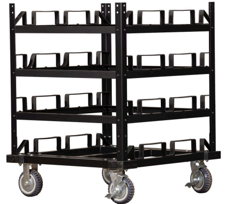
Model # CCW-02-020-00001

Small storage footprint: store posts horizontally when not in use instead of using up floor space.