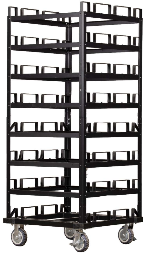
Model # CCW-02-020-00002