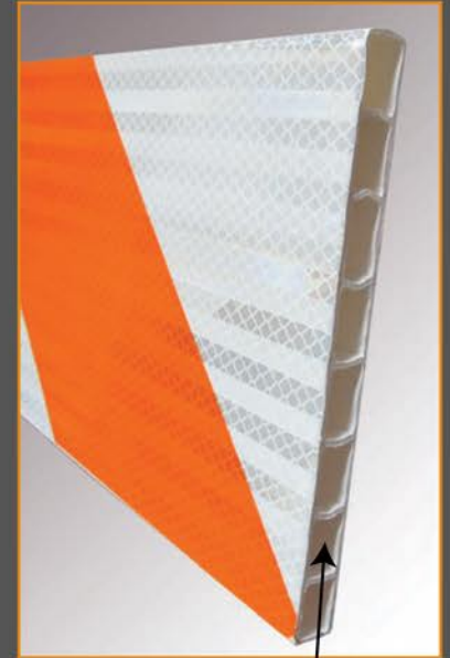
Extruded Hollow Core Design with Internal Walls for Strength and Durability