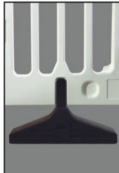
feet rotate for stacking