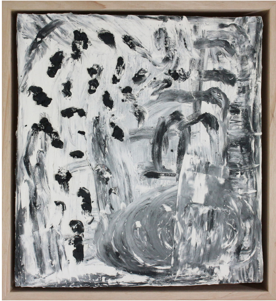
Currawongs in the Trees