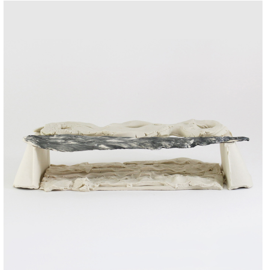
A Feather and Spaces for Light