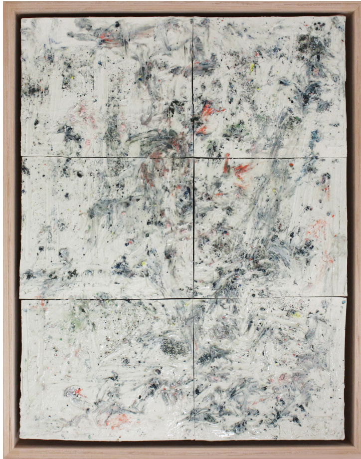
Everything We Know and Everything We Don't