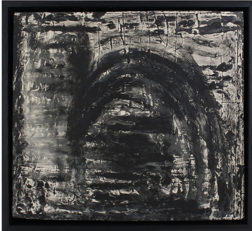
Shadows Danced Before We Left