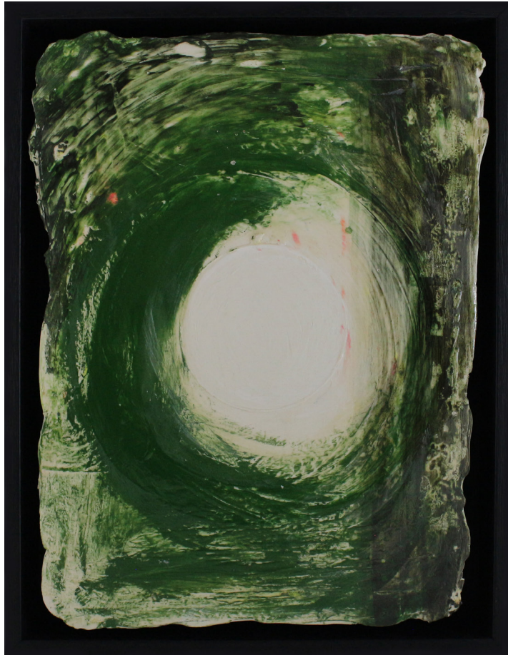
Grass, Blossom and Moon