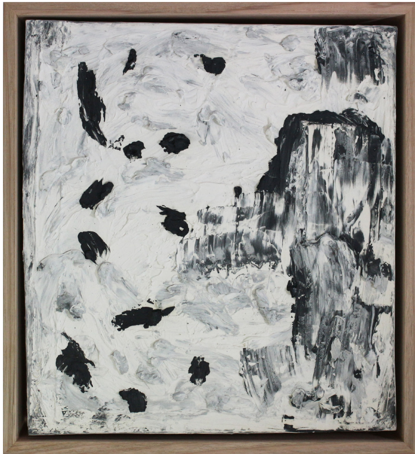
Currawong's & Waterfall