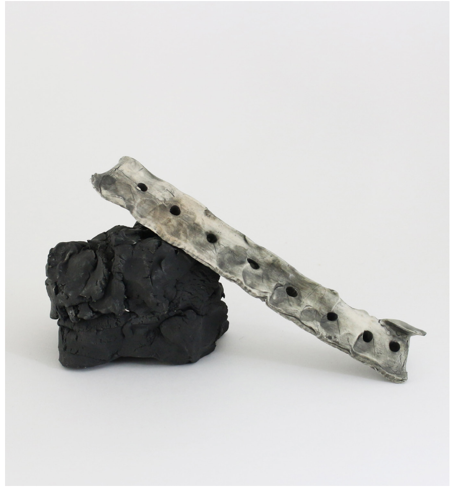
Sown from Soil

Quartz clay mixed with Southern and Nth. Eastern Victorian soil, sand and clay loam, porcelain pigments, under-glaze, oxides