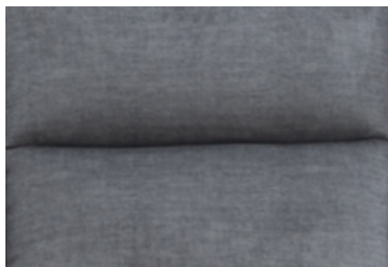
Premium breathable fabric