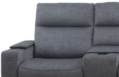
Modern and contemporary style

The Harper theater lounge is the ideal modern lounge. With its sleek, stylish design and supreme comfort provided by the premium, breathable upholstery and sturdy timber supports. Set the tone in any space with this must-have piece.