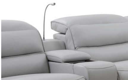
Storage console with cup holders & reading light