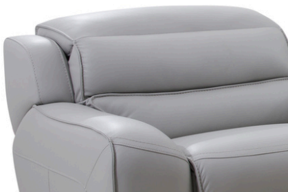
Thick padded cushions for ultimate comfort and relaxation