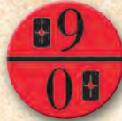
Caesar Influence token