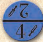
Pompey Influence token

Each Influence token has an icon and two numbers. The Icon shows the type of Border space that can be occupied by the token, while the numbers show the different values of Influence that is exerted to the two adjacent provinces while the token is on the map.