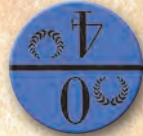
Pompey wild Influence token

Influence tokens with the “laurel” icons are considered wild, and can therefore be placed on any Border Space on the game board.