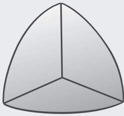
^ ART. 115.1

Supply and installation of [ITALPROFIL]® inside and outside corners or similar, made from synthetic rubber IGOM.CE.