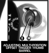
ADJUSTING MULTI-POSITION OFFSET TRIGGER THUMB BARREL

NOTE: INSURE SCREW D IS LOOSENED COUNTER-CLOCKWISE TO INSTALL DOWEL PIN BY HAND WHEN TRANSFORMING TO TRIGGER MODE. DO NOT USE HAMMER TO INSTALL DOWEL PIN.