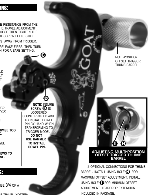
MULT-POSITION OFFSET TRIGGER THUMB BARREL

NOTE: NEVER COMPLETELY REMOVE ANY ADJUSTMENT SCREWS TO INSURE LOCK PATCH DOES NOT FALL OUT INSIDE RELEASE.