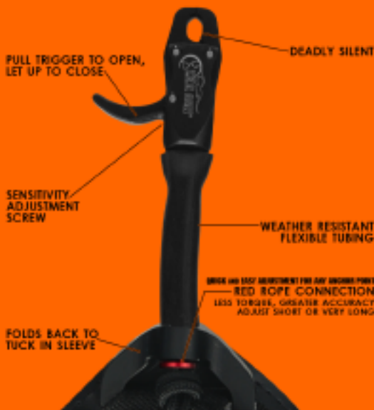
THE BANDIT (TBDB-BK-L) Buckle / Std Jaw / Black / Large

WARNING: This product can expose you to chemicals including Nickel Acetate, which is known to the State of California to cause cancer or birth defects or other reproductive harm. For more information, visit www.795Warnings.ca.gov .