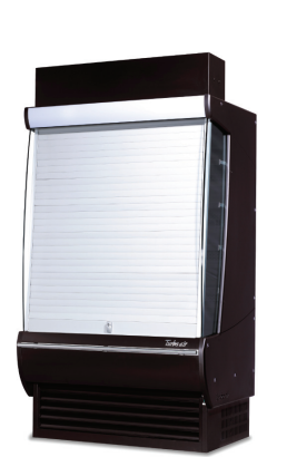
W/ Security cover (optional)