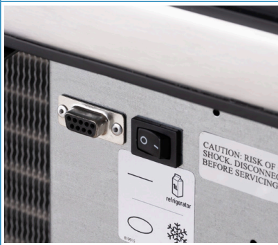
Refrigerator/Freezer Toggle Switch located Behind the Grill