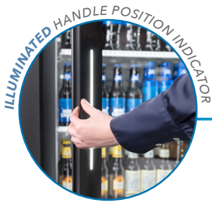
ILLUMINATED HANDLE POSITION INDICATOR