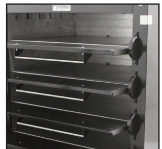
Adjustable Dampers at each deck