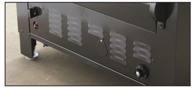
Easy access front controls