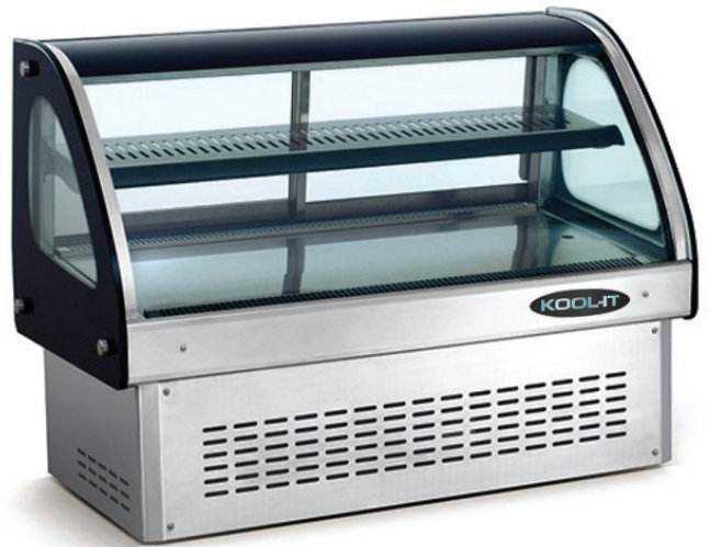
Attractively designed base allows display to be used either as a drop-in or as a freestanding countertop unit.