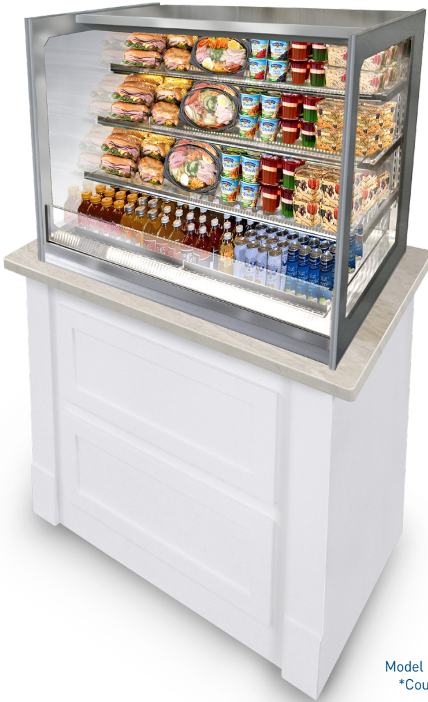
Model ITRSS3634 Shown *Counter Not Provided

Designed for customers looking for rich, up-scale Italian styling for maximum visual appeal that will drive product sales.