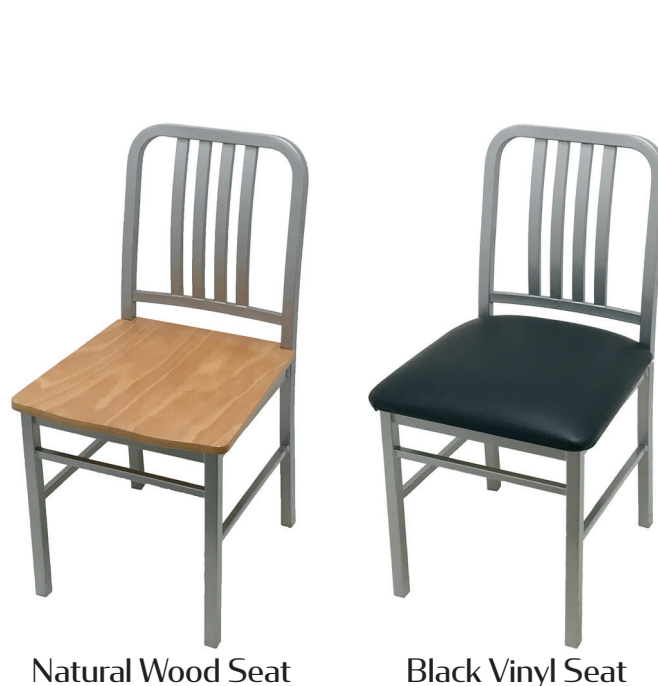
latural Wood Seat Black Vinyl Sea CM-256-STEEL CM-256-BLK