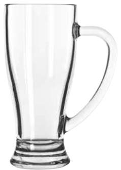
Cafe Mug No. 5286 14 oz./41.4 cl./414 ml. H6¼ T3½ B2¾ D5 1 doz./17# • .86 cu. ft. SCC 592061