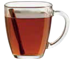
Square Mug No. 5352 14 oz./41.4 cl./414 ml. H4 T3¾ B2½ D4¾ 1 doz./10# • .68 cu. ft. SCC 394580