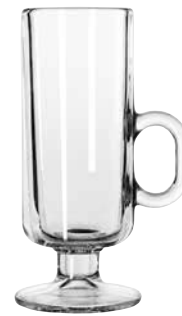
Irish Coffee No. 5292 8 oz./23.7 cl./237 ml. H6 T2¾ B2¾ D3¾ 2 doz./25# • 1.06 cu. ft. SCC 878161