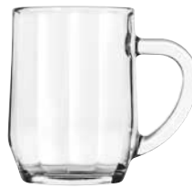
All Purpose Optic Mug No. 5725 10 oz./29.6 cl./296 ml. H4½ T2½ B2¾ D4¾ 3 doz./30# • 1.37 cu. ft. SCC 373557