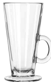
Irish Coffee No. 5293 8½ oz./25.1 cl./251 ml. H5½ T3 B2¾ D3¾ 2 doz./21# • 1.04 cu. ft. SCC 878154