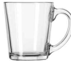
All Purpose Mug No. 5544 13½ oz./39.9 cl./399 ml. H4½ T3¾ B2¾ D5 1 doz./11# • .64 cu. ft. SCC 269673