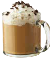
Mug No. 5213 13 oz./38.5 cl./385 ml. H3¼ T3¾ B3¾ D4¼ 1 doz./13# • .52 cu. ft. SCC 886531