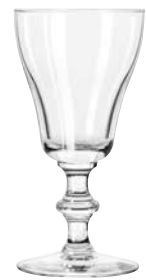
Georgian Irish Coffee No. 8054 6 oz./17.7 cl./177 ml. H5¼ T2½ B2½ D2½ 3 doz./15# • 1.25 cu. ft. SCC 435095