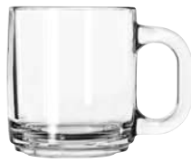
Mug No. 5201 10 oz./29.6 cl./296 ml. H3½ T3¼ B2¼ D4½ 1 doz./10# • .44 cu. ft. SCC 708673