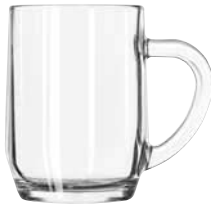
All Purpose Mug No. 5724 10 oz./29.6 cl./296 ml. H4½ T2½ B2¾ D4¾ 3 doz./30# • 1.37 cu. ft. SCC 373540

Thermal shock, taking a cold glass and pouring a hot beverage into it, can damage glassware. It is recommended to pre-heat the glassware before adding a steaming hot beverage.