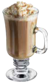
Irish Coffee with optic No. 5294 8¼ oz./24.4 cl./244 ml. H5½ T3½ B2¾ D4½ 2 doz./22# • 1.13 cu. ft. SCC 057986