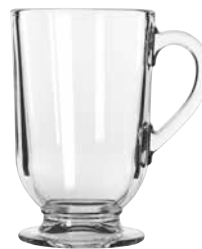
Irish Coffee No. 5304 10½ oz./31.1 cl./311 ml. H5 T3½ B2¾ D4¼ 1 doz./12# • .49 cu. ft. SCC 840298