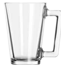
All Purpose Mug No. 5589 9 oz./26.6 cl./266 ml. H4½ T3½ B2½ D4¼ 2 doz./21# • 1.01 cu. ft. SCC 308160