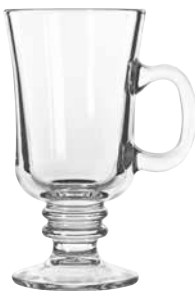
Irish Coffee No. 5295 8½ oz./25.1 cl./251 ml. H5½ T3½ B2¾ D4½ 2 doz./21# • 1.13 cu. ft. SCC 030101