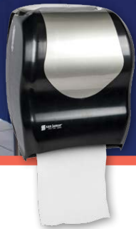
BLACK/STAINLESS LOOK - CLEAN, CONTEMPORARY, SLEEK