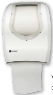
WHITE/CLEAR - CLEAN, CLASSIC, FRESH