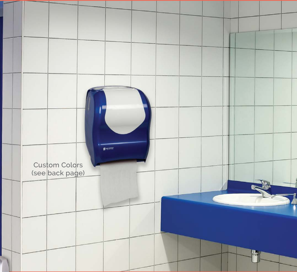
Custom Colors (see back page)

RELIABLE BEST BATTERY LIFE IN THE INDUSTRY