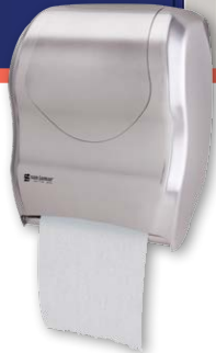
STAINLESS STEEL LOOK - HIGH END, VERSATILE, CLASSIC