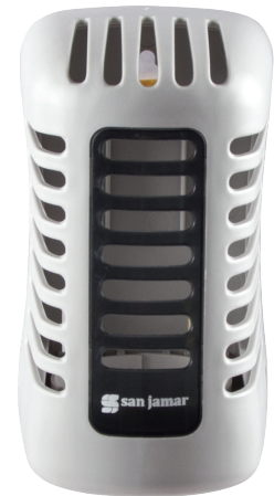
WPI07 80 1202 (Gray) WPI07 80 1203 (White)