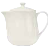
16 oz. Tea Pot w/Lid No. POT-13 Ultra Bright White H5¼ (including lid) T4¾ D6¼ 1 doz./16# • 1.2 cu. ft.