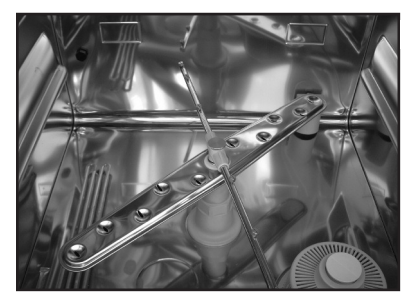
Upper and lower wash and rinse arms guarantee excellent results.