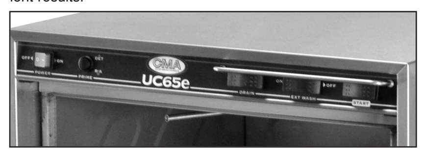
Top mounted controls are easy to read and simple to operate.