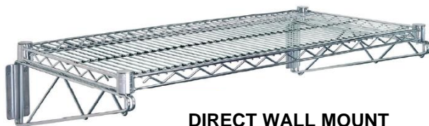
DIRECT WALL MOUNT CANTILEVER