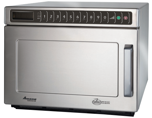
Model HDC18SD2 shown