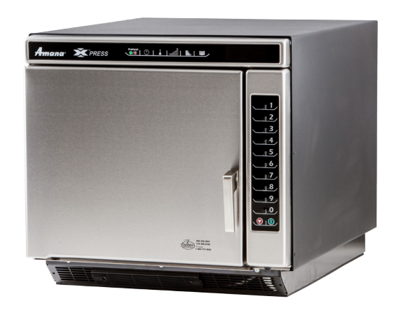
Model ACE19V shown