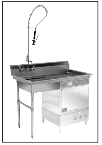
Optional dishtable and Pre-wash.