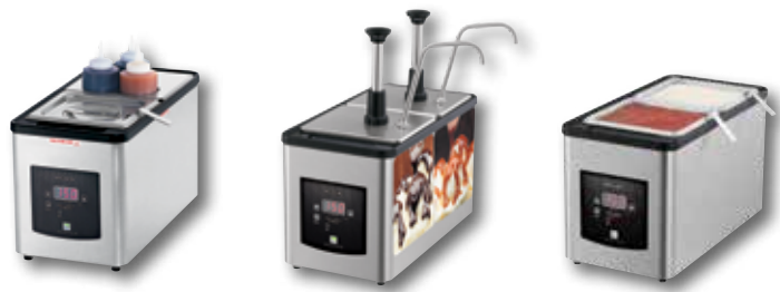
Various IntelliServ™ Combinations