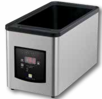
INTELLISERV™ WARMER Model IS-1/3