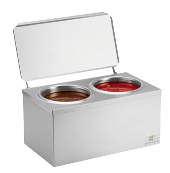
Cone Dip DI-2, 92020