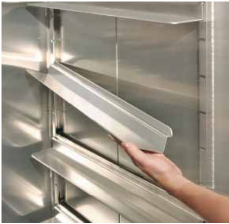
Universal glide easily adjustable