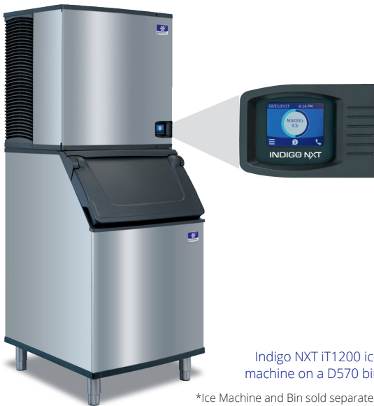
Indigo NXT iT1200 ice machine on a D570 bin