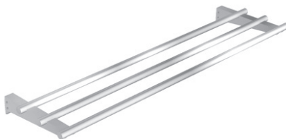
3 Bar Tray Slide