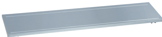
Solid Tray Slide