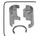
Aluminum Split Sleeve