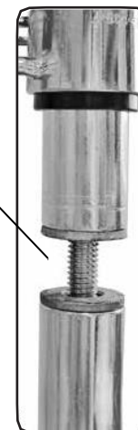
Fully Threaded Stud Connector