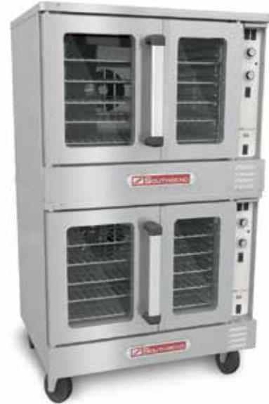
(shown with optional casters)