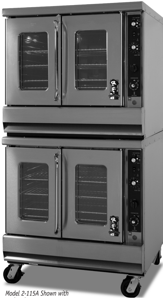
Model 2-115A Shown with optional casters.