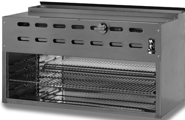
Model CM36 Shown