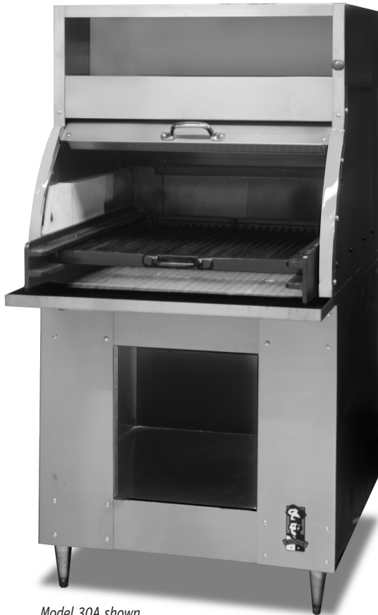
Model 30A shown