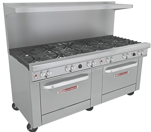
(4721DD shown with optional casters)