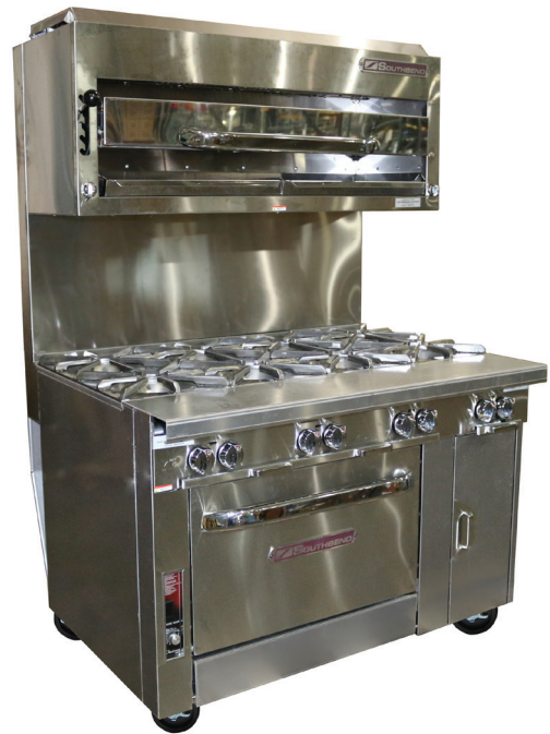
Model P48A-BBBB shown with optional 48" Salamander and casters