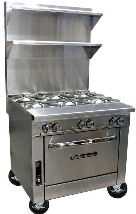
Model P36A-BBB shown with optional 36" flue riser and casters