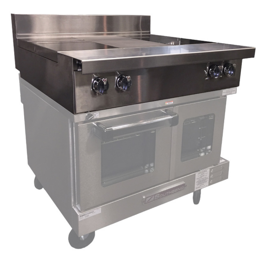
Model shown P36T-ISI

For use with induction safe cookware ONLY. Look for the induction ready logo below.